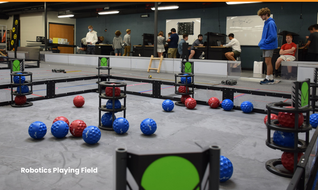
Robotics Playing Field

The new application process reduces the time required of teachers to propose grant concepts to the CEF and partners grant applicants with CEF Grant Committee liaisons early in the application process to improve communications and increase the potential of grants being funded once they are presented to the CEF Board.